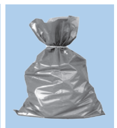
Wasting Bag A. 500 × 700mm (200pcs) B. 620 × 820mm (200pcs)

Specifications and appearance are subject to change without notice due to continuous product improvement.