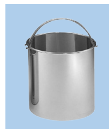
Stainless Steel Basket φ 390 × H285mm φ 390 × H375mm